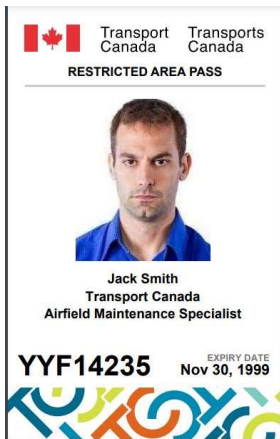
Restricted Area Pass

RAPs are issued only to those employees that have a demonstrated need and right to enter the airport Sterile Area and/or Restricted Area and have received Transport Canada Security Clearance.